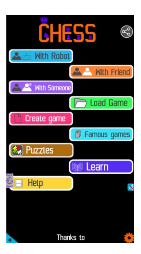
Figure 1.7: Play chess online for free. Solve puzzles and play with friends

Play chess for free at https://gbud.in/chs